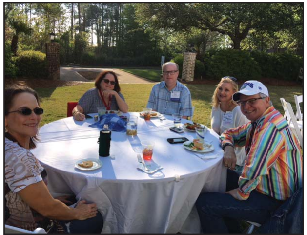
Pictured above and on the left, APPA members and guests enjoy spending time together at the reception.

Beautiful scenery and fantastic weather set the stage for our Friday night Welcome reception on the Grand Lawn. Great food and family friendly games were enjoyed by all.